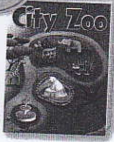
City Zoo Genre: Informational Text SOCIAL STUDIES