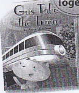
Gus Takes the Train Genre: Fantasy