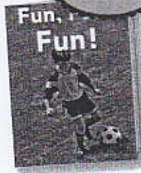
Fun, Fun, Fun! Decodable Story